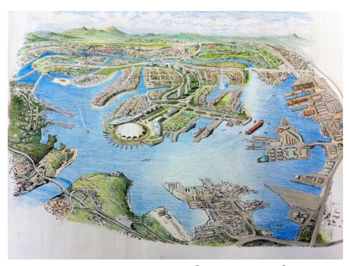
Greentown Curação Quick scan Development and Economic Outlook